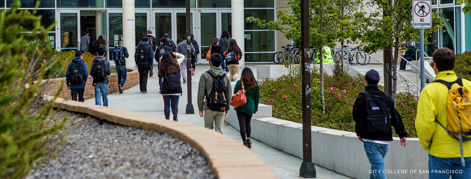
CITY COLLEGE OF SAN FRANCISCO