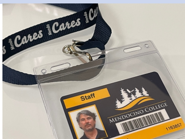
Lanyards and IDs

Hosting departmental open houses – so all campus groups—faculty, students, and others—know what each department does, the resources they offer, and who works there.