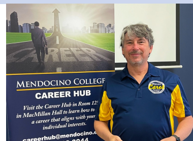
Mendo Cares Shirts