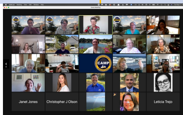
Virtual Departmental Open Houses